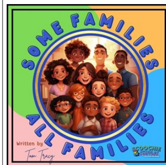
Some Families, All Families