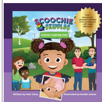
Scoochie's Adoption Story