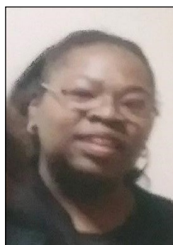
The Craig Family